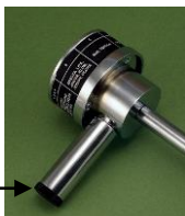
Fig. 2 cork

This warranty becomes null and void if you fail to pack your HIT3 in a manner consistent with the original product packaging and damage occurs during product shipment.